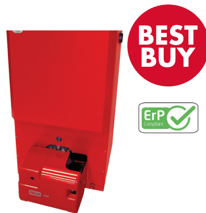
Grant Vortex boiler house 46/70kW model