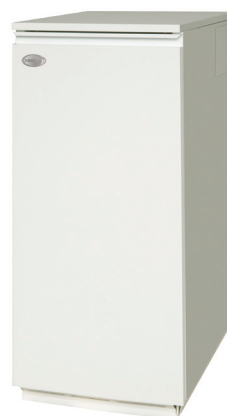
Grant Vortex utility 26kW model

Existing Grant Vortex condensing boilers are future-proofed to use HVO biofuel through making a slight modification to the boiler. This can be carried out by your local plumber or installer.