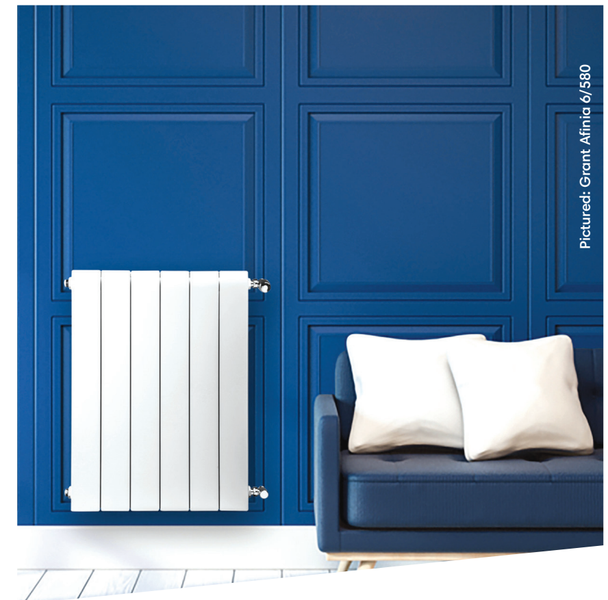
Pictured: Grant Afinia 6/580

Aluminium radiators, such as the Grant Afinia, offer high efficiency and are compatible with both high and low temperature systems. They feature excellent conductivity and, with vertical and horizontal combinations available, deliver flexibility with installations.