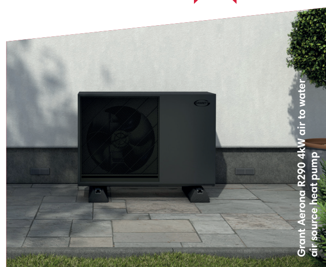
Grant Aeron R290 4kW air to water air source heat pump

The energy source used by heat pumps can also be entirely renewable, so by installing a heat pump the carbon footprint of the property is immediately reduced.