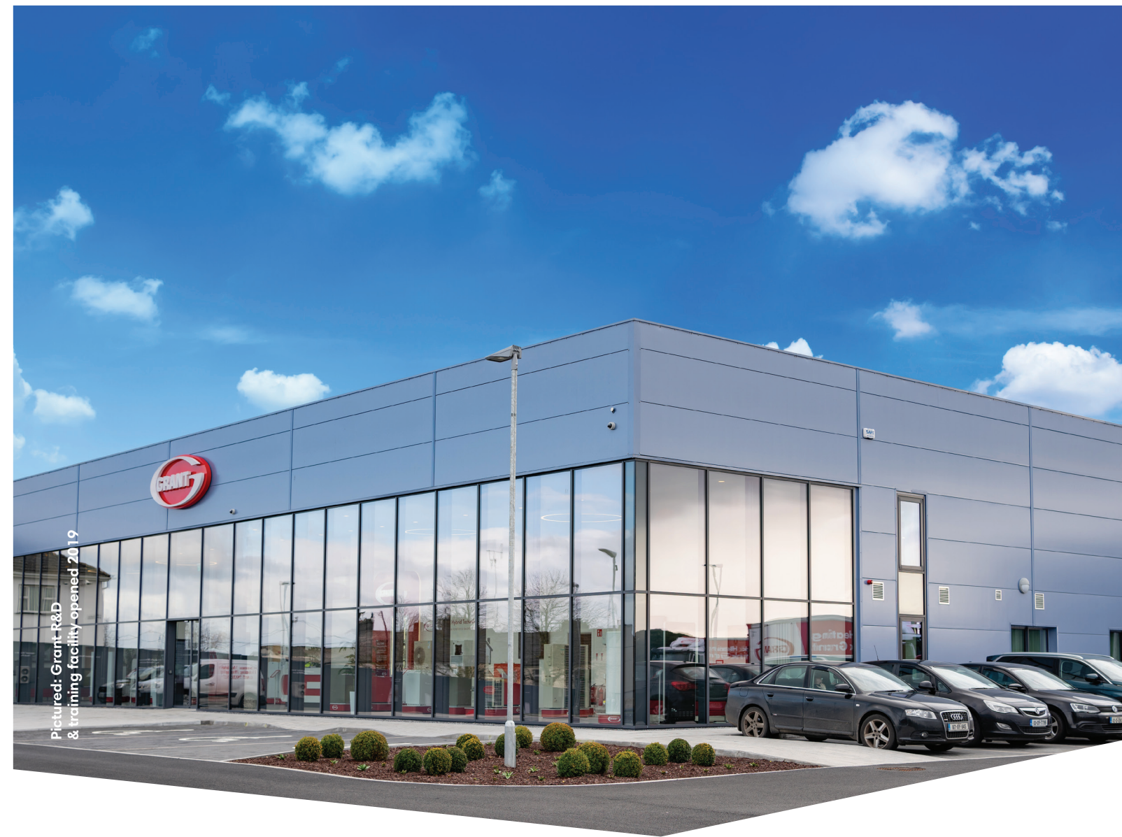
Pictured: Grant R&D & training facility opened 2019

*Find your local merchant at – www.grantni.com/support/find-a-merchant/