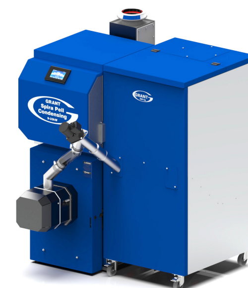
Spira Pell 9-33kW Condensing wood pellet boiler

Utilising indigenous wood pellets, these are truly an environmentally friendly heating solution, with outputs from 5 to 33kW.