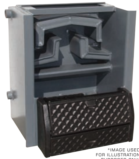
*IMAGE USED FOR ILLUSTRATION PURPOSES ONLY

Grant Engineering (Ireland) Ltd. with modern technology and modern methods of manufacturing, have developed the super efficient Grant Easy-Clean Triple Pass Boiler with Queen Star Fire. Outputs can be increased by keeping the flueways clean with the unique easy-clean system. This unique design gives maximum efficiency and the reason for the high efficiency and high output is the triple pass principle. The major advantages of this system over other boilers is sending the flames vertically downwards on the second pass, so entrapping the flames much longer. The output is also enhanced by the fact that the flames rapidly change direction which aids combustion and heat transfer. This is an obvious advantage over boilers with a straight vertical flue where the flue gases rise undisturbed through the flueways at a greater speed. Also a new development – the extreme ease in which the boiler can be cleaned, taking only about five minutes weekly to clean the flueways. The Grant Easy-Clean Triple Pass Boiler is ideal for link up with oil boilers. With this unique design and high efficiency this must be the boiler for you.